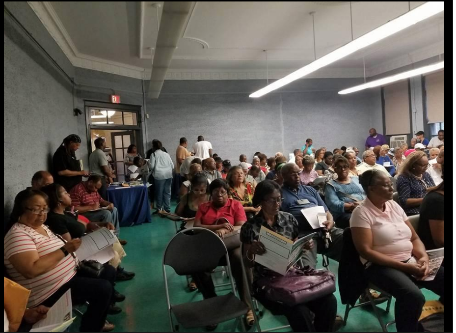
Capacity crowds at CCC Legal Clinic & Tax Appeal Days