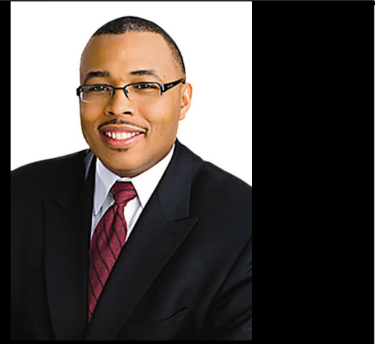
Celebrate Black History